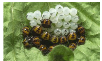
Fig. 6. Early nymphs are black, yellow and red in color. 6