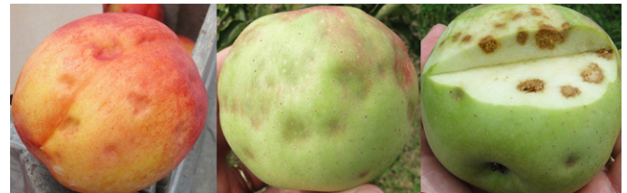
Fig. 2. Feeding causes necrotic lesions and pits. 2

Adult BMSB are strong fliers and adept hitchhikers. They can move from one host site to another in just a few hours. Like other "true bugs," they feed by inserting their straw-like mouthparts into the plant to suck out the sap. BMSB will feed on leaves, seeds, fruits, and even through the bark of young trees. Feeding causes areas of collapsed tissue that becomes dried and necrotic (dark colored), and can also introduce disease pathogens into the plant. On crops such as tree fruits and some vegetables this damage is generally visible on the surface as necrotic lesions (Fig. 2), but BMSB feeding can also cause deeper, less obvious damage. Some growers have found that a crop that was seemingly clean at harvest will show damage after 4-5 weeks in storage.