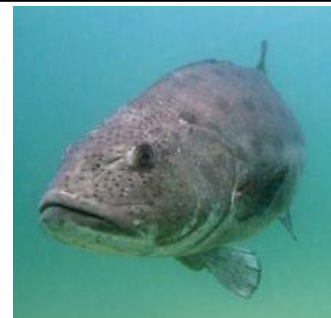
Black Sea Bass