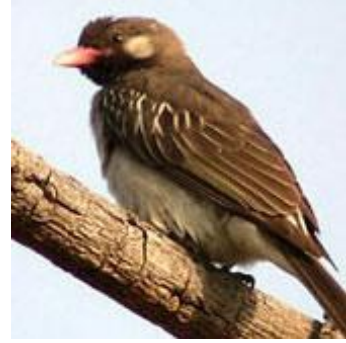
Honey Guide Bird