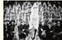
President T.R. Roosevelt declared the wolf a “beast of waste and destruction” as the U.S. embarked on systematic eradication.