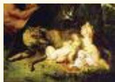
In Roman mythology, the twins Romulus and Remus, raised by a she-wolf, found the city of Rome.