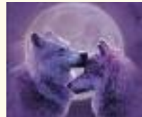
Modern fans embrace the wolf as intelligent, sensitive beings restored to their rightful place.