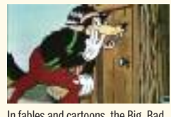
In fables and cartoons, the Big, Bad Wolf uses cunning and deceit to trick Little Red Riding Hood, the Three Little Pigs, and other innocents.