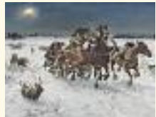
For centuries Europeans feared wolves. “Wolves Chasing Sleigh” was a popular subject for painters.